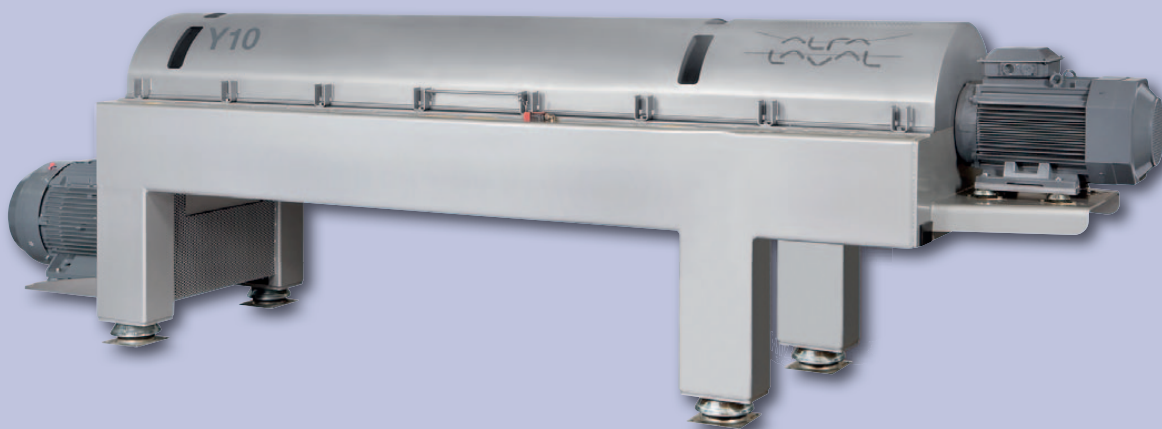
The Y10 decanter centrifuge